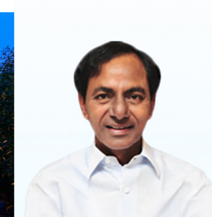
Sri K Chandrashekar Rao Hon'ble Chief Minister