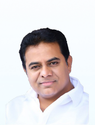
Sri K T Rama Rao Hon'ble Minister for MA&UD, IT, Industries.

Municipal Administration and Urban Development Department GOVERNMENT OF TELANGANA