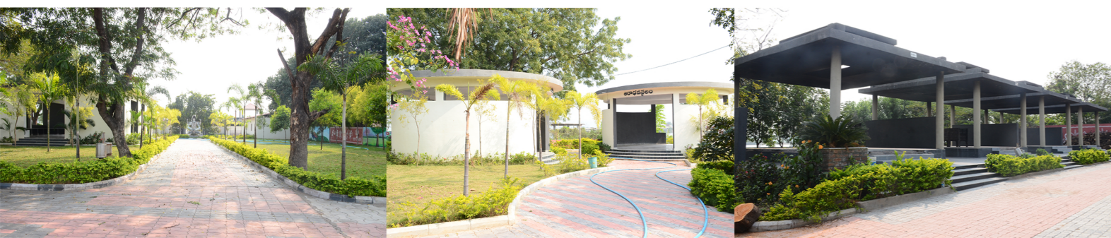
Vidya Nagar Vaikuntadhamam - Sircilla